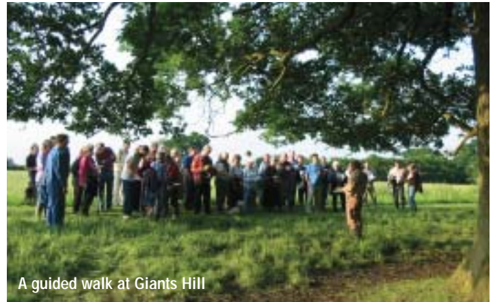
A guided walk at Giants Hill

4 House Platform and Tree 'Ring'. A medieval house platform. The house, which would have been built of timber and wattle and daub,