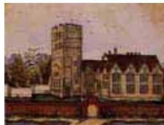
Camps Castle engraving