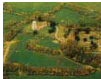
Camps Castle - aerial view