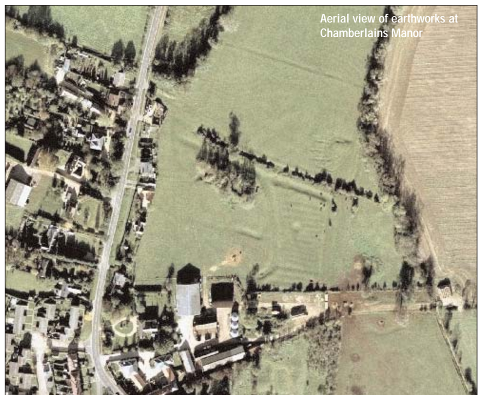
Aerial view of earthworks at Chamberlains Manor