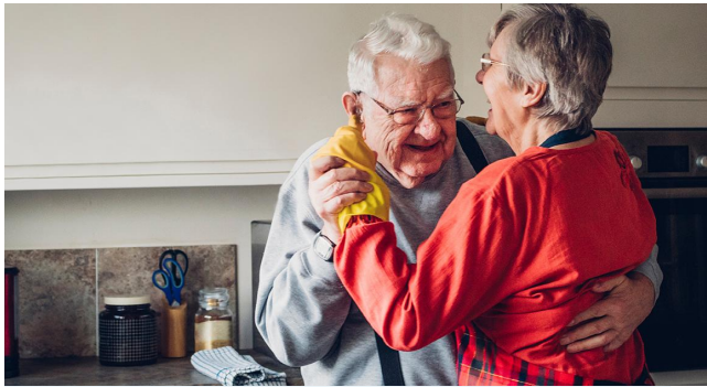
Be a 'Get Bert Dancing Again' Worker

login=https%3a%2f%2fpublicsectorjobseast.co.uk%2fpages%2fpre1.aspx%3fjobId%3d15191%26done%3dhttps%253a%252f%252fpublicsectorjobseast.co.uk%252fSee%252520The%252520Difference%252520-%252520Reablement%252520Roles-Variou%252520places-working%252520out%252520of%252520office%252520base%253fjobId%253d15191%2526JobIndex%253d22%2526categoryList%253d%2526minsal%253d0%2526maxsal%253d150000%2526workingpattern%253d%2526keywords%253d%2526employee%253d-1%2526postcode%253d%2526Distance%253d0%2526AdvertiseOn%253d0 .