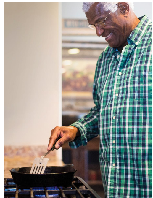
Be a 'Get Louis Cooking On Gas Again' Worker